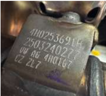
Figure 1. The production date is stamped.

The production date is shown in the first 6 digits of the second line as YYMMDD format. The production date of the exhaust flap in image 1 is March 24 th , 2025.