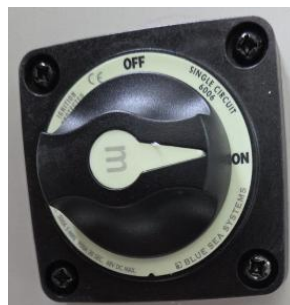
Thor Motor Coach 1-877-500-1020 TSB 26-02