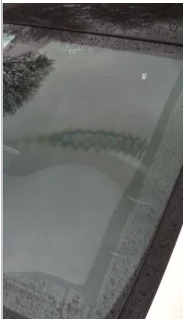
Figure 3 - Streaking due to excessive downforce of the wiper arm