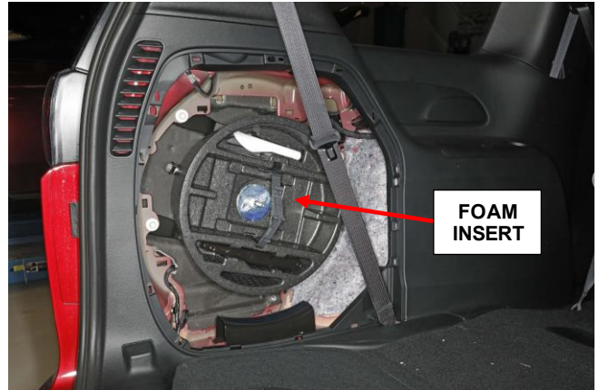
Figure 3 – Foam Insert Installed