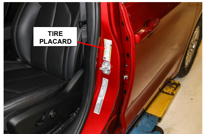
Figure 5 – Tire Placard Location