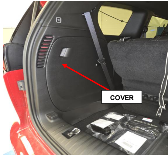
Figure 1 – Trim Cover