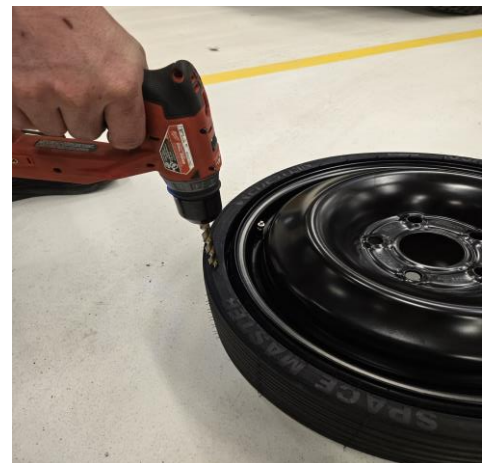
Figure 4 – Drill Location