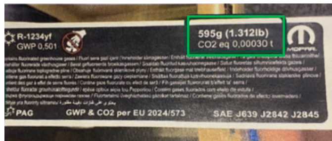
Fig. 2 Correct Label