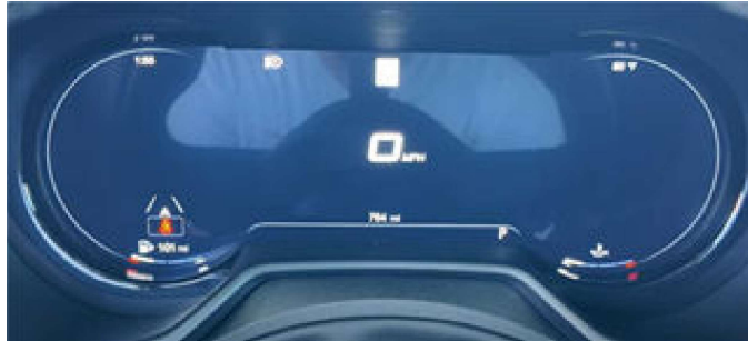
Fig. 5 Relax Mode Example

For any other issues or concerns normal diagnostics should be performed.