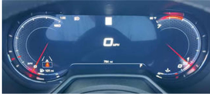
Fig. 4 Evolved Mode Example