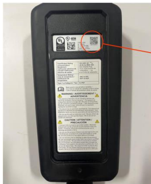
Toyota EV Charger (bottom side)