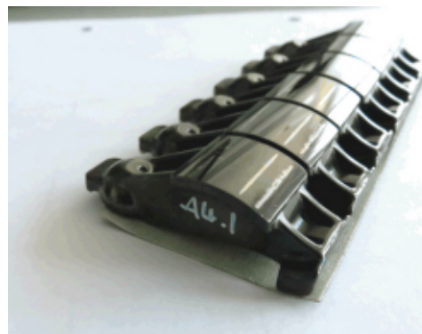
Marking valve levers