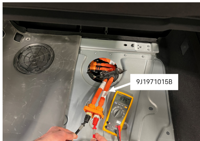
Figure 4 - Measuring Capacitance on Rear PE