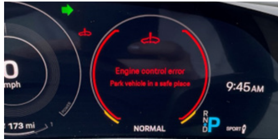
Figure 1 “Engine control error” in instrument cluster