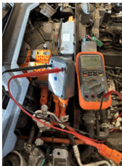
Figure 3 - Measuring Capacitance on Front PE