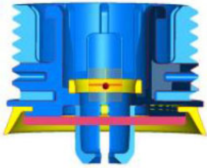
Figure 2. Cross-section of buffer stop 83H.827.499.A with double-sided adhesive tape.

Process optimization and component optimization (additional double-sided adhesive tape) were implemented at the factory in week 43 / 2025. The optimization was incorporated into bump stop 83H827499A.