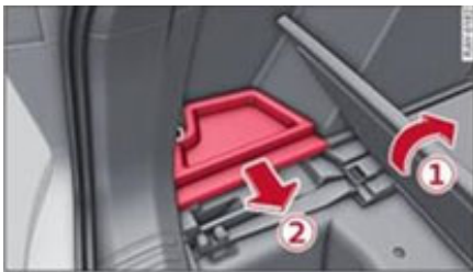
Figure 1: Fuse carrier installation location: luggage compartment on left, open cover.