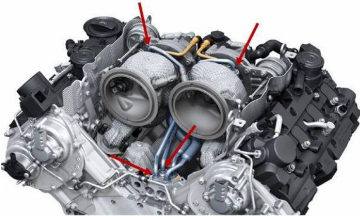
Figure 3: Location of the O-rings.