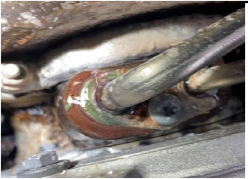
Figure 1. Coolant leak at the return lines to the turbocharger.