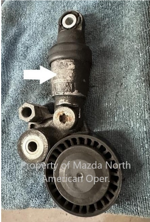
Dry / Normal Dirt Accumulation