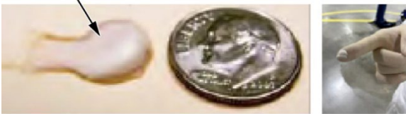
0.5 GRAM OF SILICONE GREASE

NOTE: Make sure to wipe off any grease from the shaft.