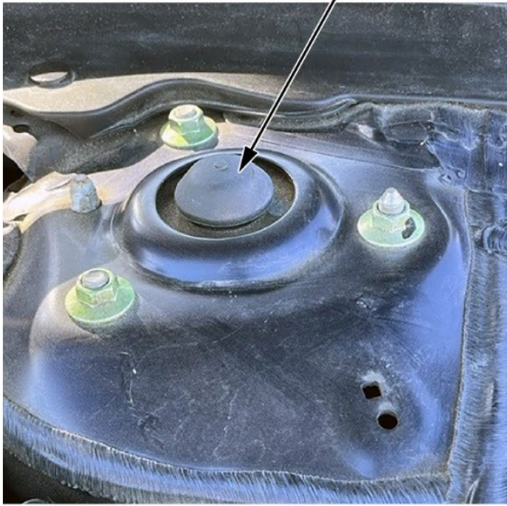
Front Damper Dust Cap