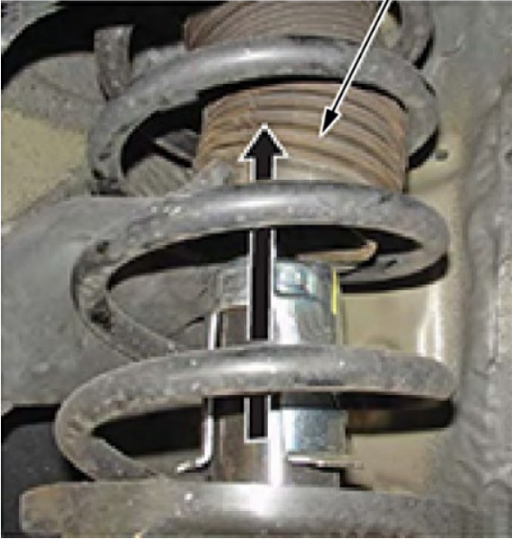
DAMPER DUST COVER