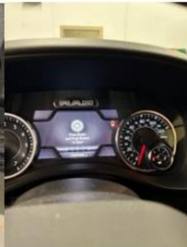
F. Confirm ajar light is now on. You can now close the door.

This document does not authorize warranty repairs. This communication documents a record of past experiences. STAR Online does not provide any conclusions about what is wrong with the vehicle. Rather, it captures all previous cases known that appear to be similar or related to the vehicle symptom / condition. You are the expert, and you are responsible for deciding on the appropriate course of action.