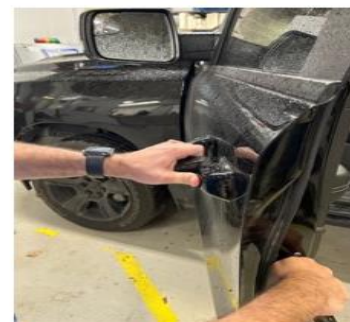
B. While pushing the screwdriver in the catch to open, pull on the outside Handle.

This document does not authorize warranty repairs. This communication documents a record of past experiences. STAR Online does not provide any conclusions about what is wrong with the vehicle. Rather, it captures all previous cases known that appear to be similar or related to the vehicle symptom / condition. You are the expert, and you are responsible for deciding on the appropriate course of action.