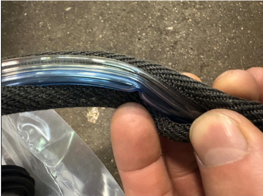
Fig 2. Example Of Line Pinching From Push Pin.

To gain access to remove the push pin the seat back will require removal. Refer to Service Library 23 - Body / Seats, Front / SUPPORT, Lumbar / Removal and Installation COMFORT SEAT VALVES. Then carefully use a pair of side cutters to cut the loop retaining the line bundle shown in Fig 1. Use a trim stick to remove the push pin from the seat frame. Once accomplished, using finger pressure to restore the round shape of the lines to clear any pinch area. Then assemble the seat back and test operation of the massage feature.