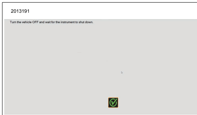
Figure 3. Power OFF Vehicle

An additional ignition cycle will be required and is part of the on-screen directions.