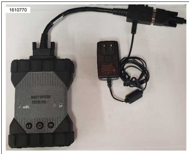
Figure 1. External Power Adapter