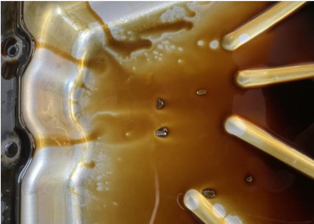
Figure 1. Large debris present in oil example