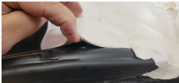
FIG. 3 – NON-PRIMED EXAMPLE

SHOWN AS CURB SIDE – ROAD SIDE IS OPPOSITE