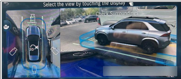
HU View After SCN Coding.jpg