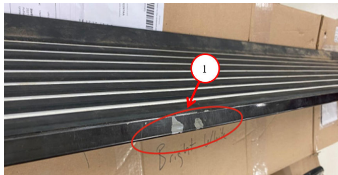
Fig. 1 Paint Peeling Example

This Technical Service Bulletin (TSB) has also been released as a Rapid Service Update (RSU) 25-026, date of issue February 28, 2025.