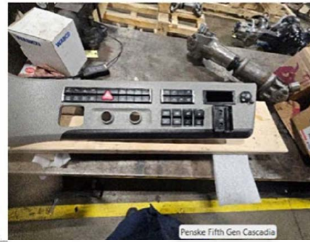
Dash Side Panel