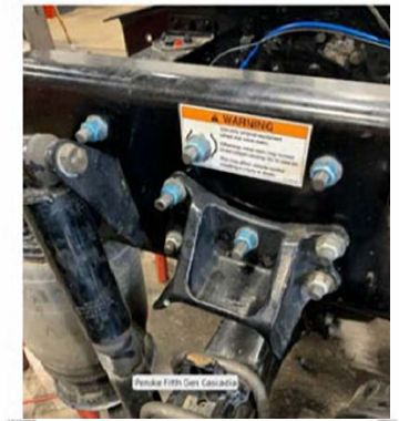
Right-Hand Lateral Rod and Bolt Installation After Drilling Is Completed