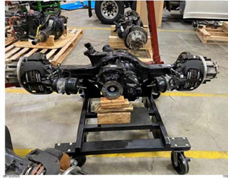
Axle Removed from the Chassis