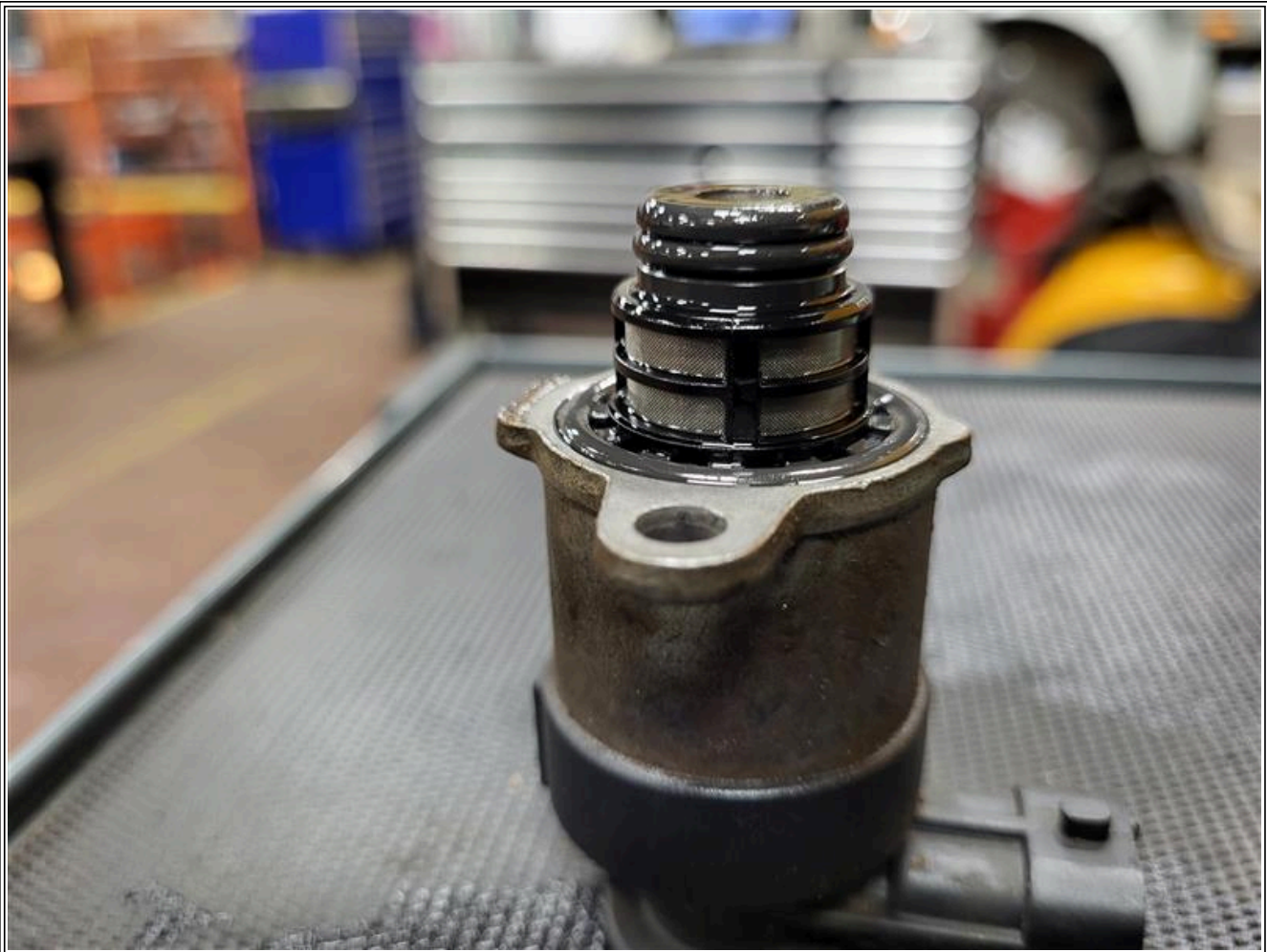
Step 3 , Image #2: Clean EFA1