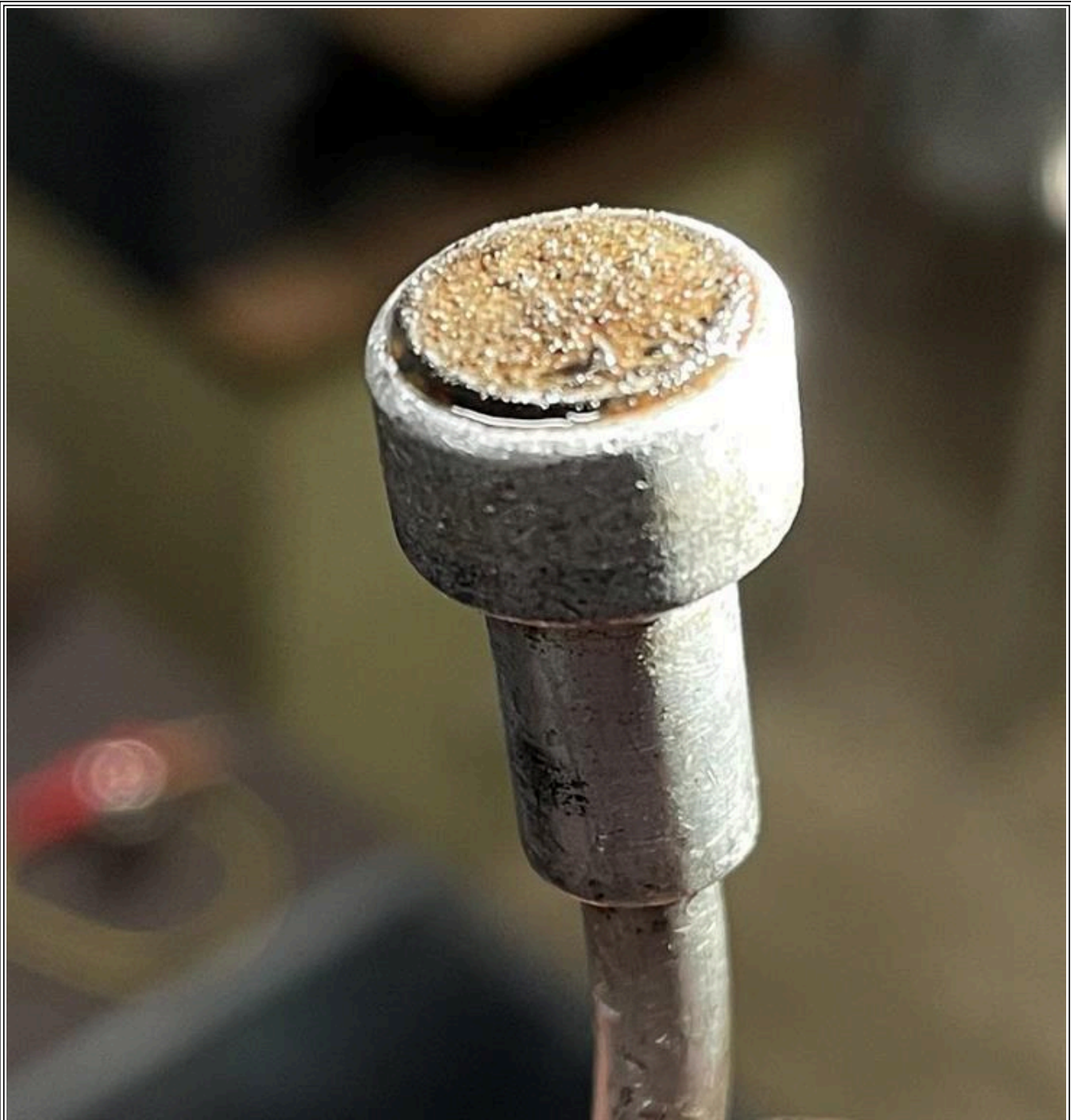
Step 3 , Image #3: Fuel Tank Metal