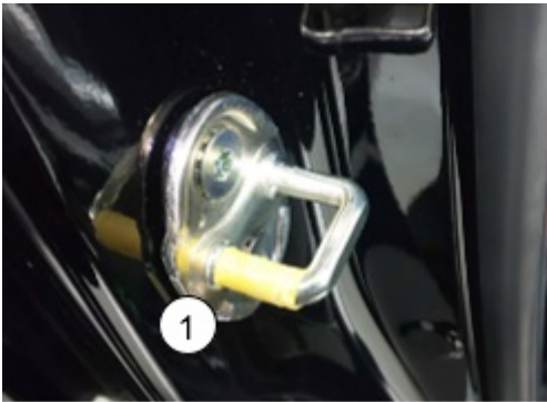
(1) Masking tape

Wrap masking tape around the engagement point of the striker, wrapping the tape around the striker to increase its diameter by approximately 0.04 inch (1 mm). For example, assuming a tape thickness of 0.1 mm, wrap around 5 to 6 times.