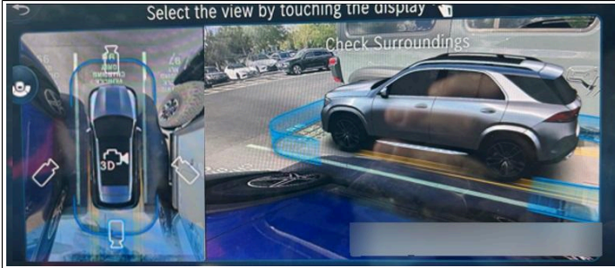
HU View After SCN Coding.jpg