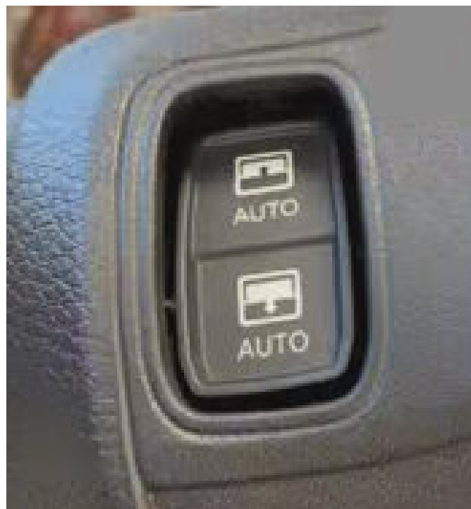
Fig. 1 Collapsed Switch Power Top Switch

This Technical Service Bulletin (TSB) has also been released as a Rapid Service Update (RSU) 26-029, date of issue February 07, 2026. All applicable RSU VINs have been loaded. To verify this RSU service action is applicable to the vehicle, use VIP or perform a VIN search in DealerCONNECT/Service Library. All repairs are reimbursable within the provisions of warranty.