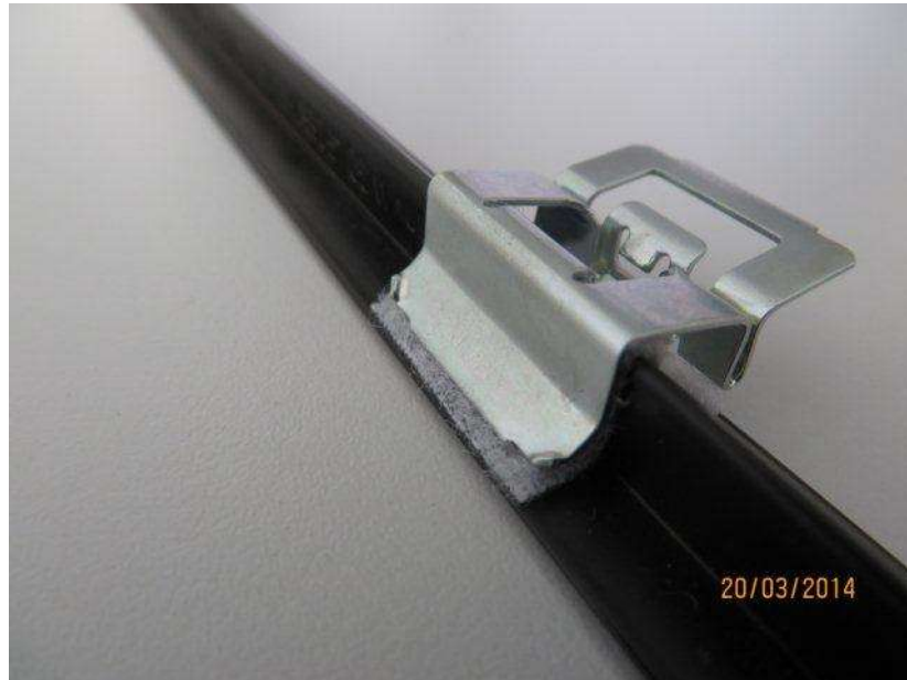
Figure 4. Retaining clip isolated with the fabric adhesive tape.