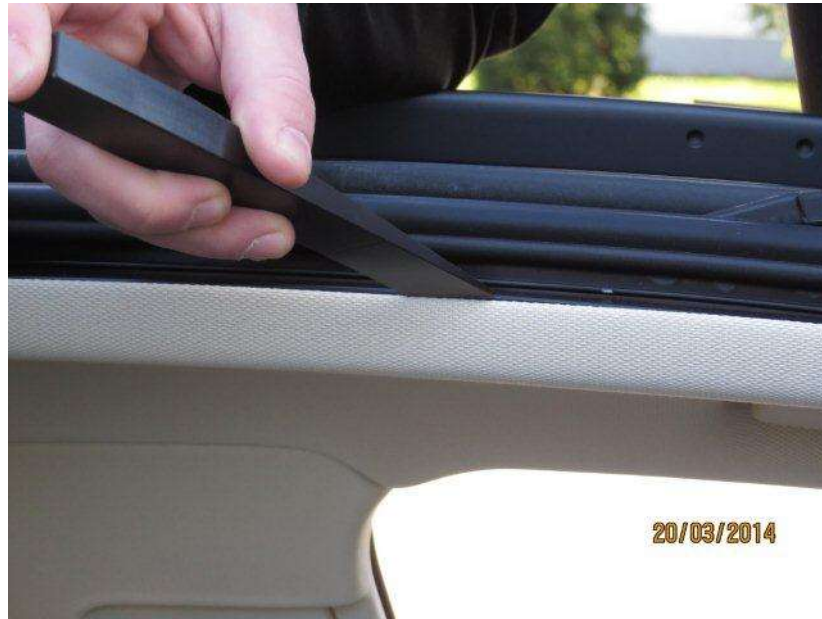
Figure 2. Unclipping the T-frame.

It is not necessary to remove the headliner (Figure 2).