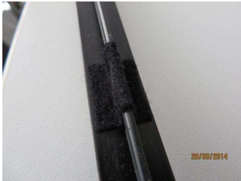
Figure 3. Fabric adhesive tape section applied.