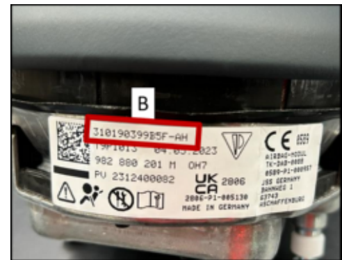
Airbag module number (sample illustration)