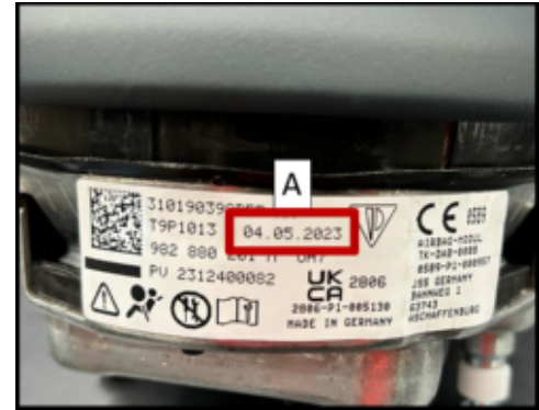
Production date (exemplary representation)