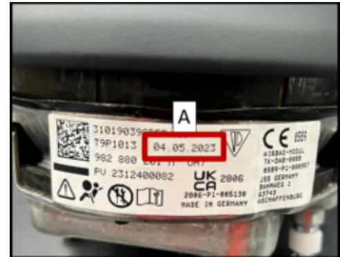
Production date (exemplary representation)