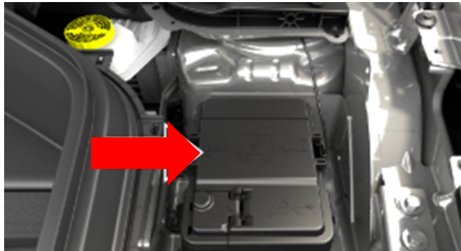
Fig. 2 Front PDC Cover