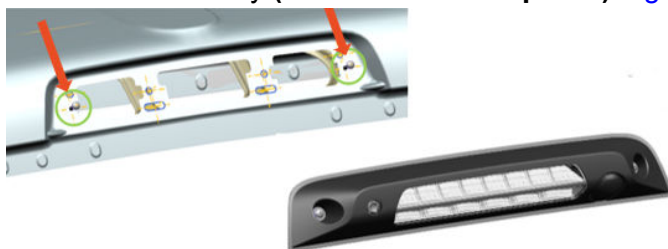
Fig. 1 CHMSL Assembly With Two Screws