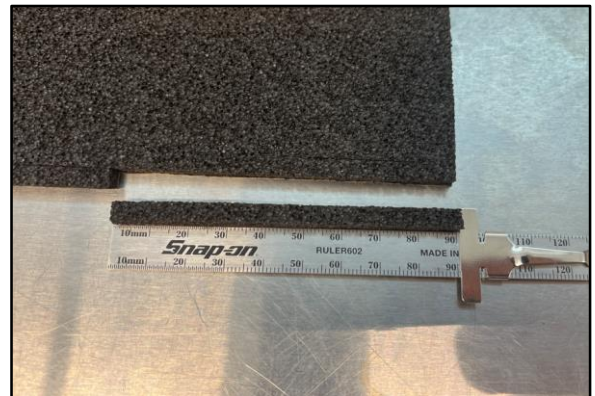
Figure 2. 90 mm x 5 mm x 5 mm EPT Foam Strip

The EPT foam sheet is already sectioned in 5 mm wide sections. It is only required to measure 90 mm in length before cutting the strip.