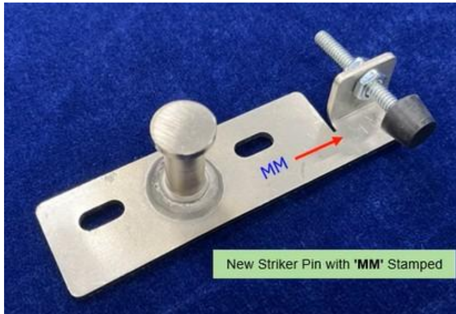
Striker pin assembly identification marks.

NOTE: If the existing striker pin assembly has “MM” stamped under the bumper, no need to replace. If the striker pin assembly do NOT have “MM” stamp under the bumper, proceed to the instructions below.