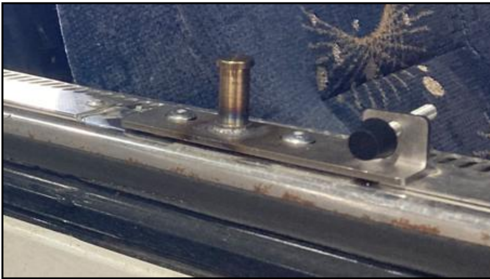
Figure 1: Striker pin bracket assembly installation reference.