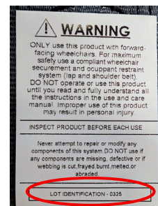
LOT IDENTIFICATION 0325

ONLY PROCEED IF THE RETRACTOR MATCHES THE PHOTOS ABOVE