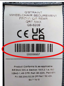
LOT NUMBER 58957