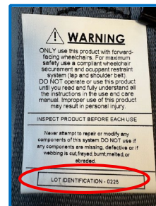
LOT IDENTIFICATION 0225

ONLY PROCEED IF THE RETRACTOR MATCHES THE PHOTOS ABOVE