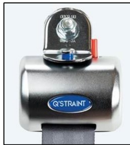
QRT MAX NO KNOBS