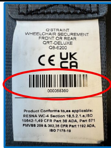
LOT NUMBER 58350