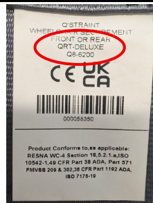
PART NUMBER Q8- 6200