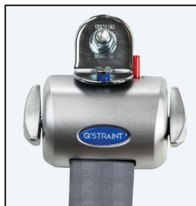
QRT DELUXE TWO (2) KNOBS