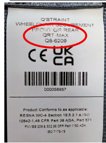
PART NUMBER Q8- 6209