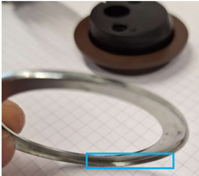
Fig. 1: Collar metal ring