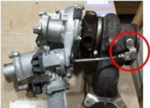
Illustration 1) wastegate rod (affected area on turbocharger)