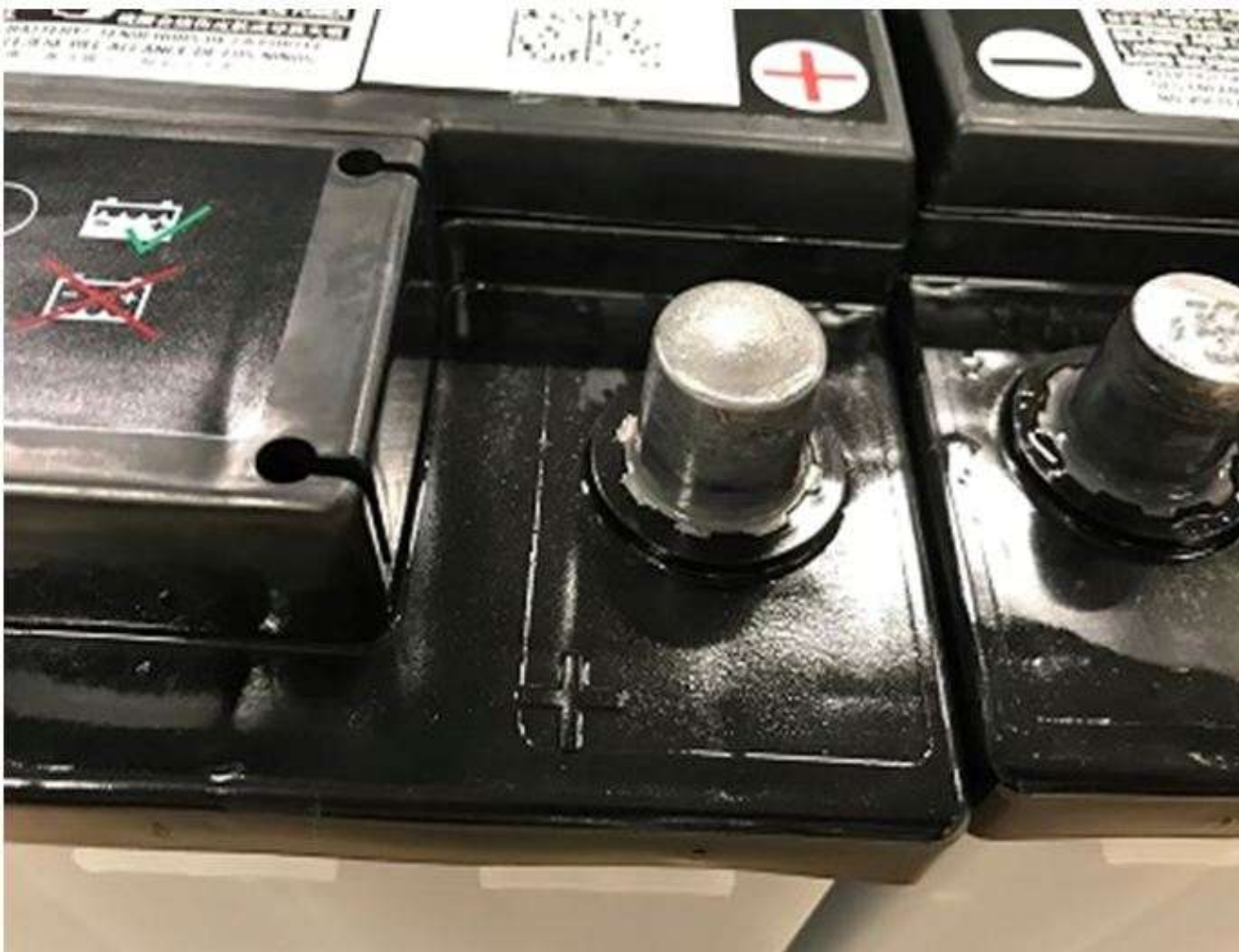
Figure 1. Supplier applies micro-oil as corrosion protection on end terminal and at transition between end terminal socket and cover.

Supplier applies micro-oil as corrosion protection on end terminal and at transition between end terminal socket and cover (see photo 1). These batteries are OK and do not need to be replaced.