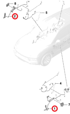
Figure 2 - Door harnesses