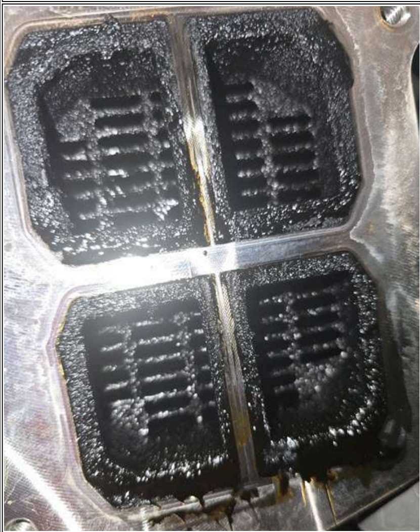
Example of an EGR cooler with soot/fuel mixture