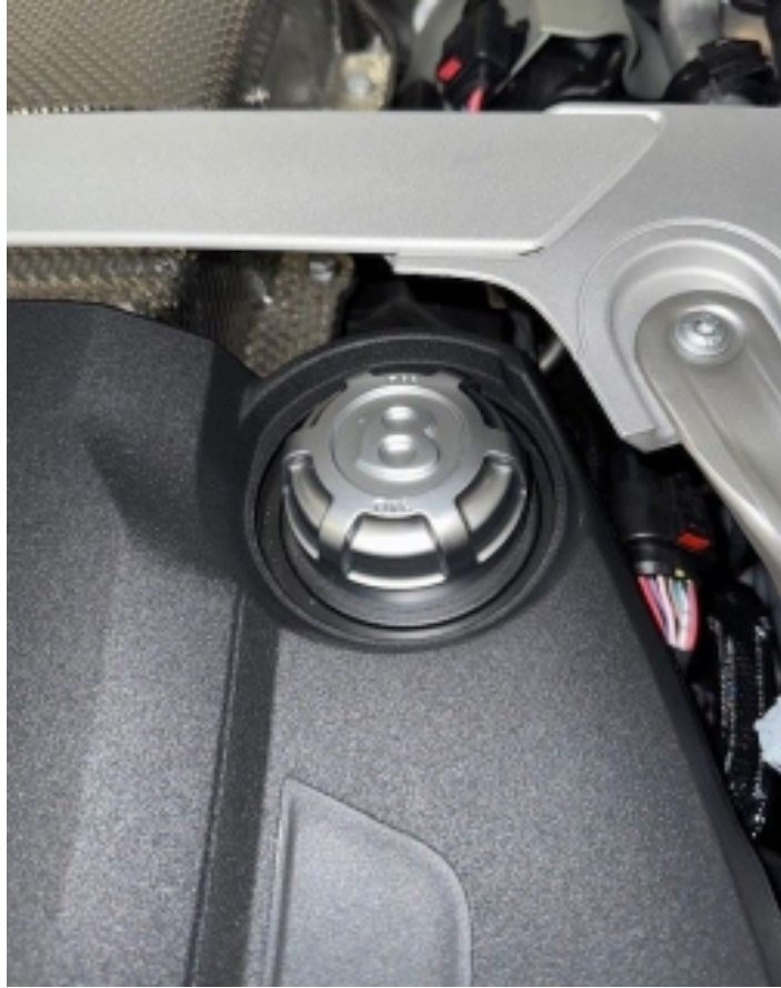
Figure 4 OK Oil filler cap part specification