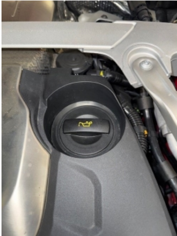
Figure 3 NOK Oil filler cap part specification

3. If the oil filler cap does not match the specified part, as per figure 3. Replace it with the correct specification part listed in the genuine parts section.