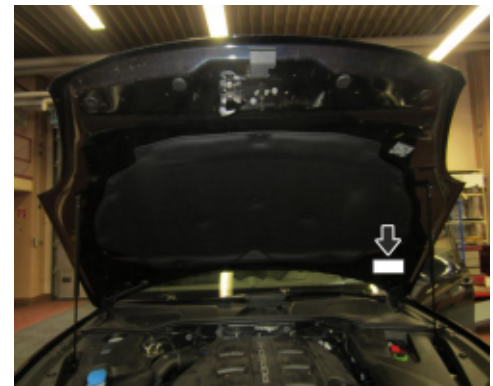
Proof of Completion Label: specified position (Exemplary illustration)