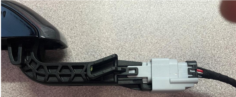
Figure 2: Reconnect the connectors.