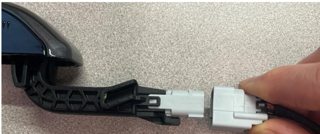
Figure 1: Disconnect the door handle and wire harness connectors

Disconnect and reconnect the handle & wire harness connectors (See Figures 1 & 2) and verify if the handle unlocks and locks the doors (See Figures 3 & 4). Use the push, push, pull method to ensure the connector is fully connected.