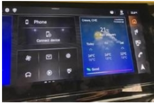
Figure 2 – Example weather app with a data plan