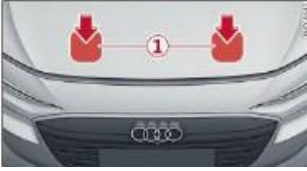
Figure 2. Press on the hood where indicated.