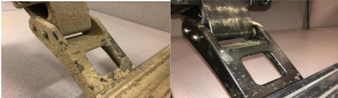
Fig 1 Before and after pressurized water cleaning