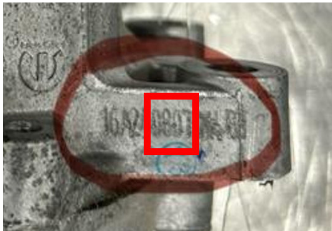
Fig. 2 Serial Number