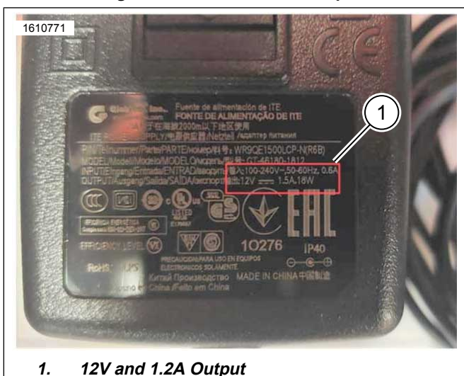
1. 12V and 1.2A Output