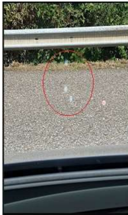
Figure 2. HUD reflections.