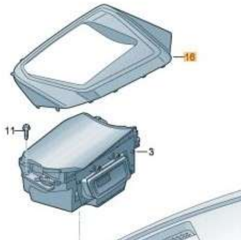
Figure 3: HUD cover (parts catalogue).