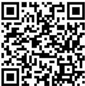
Figure 1. Scan the above QR code or visit https://audi-external.kzoplatform.com/player/medium/3009172724003116808 to watch a video demonstrating the process described below.