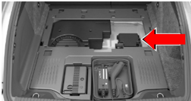
Fig. 2 Rear PDC Location